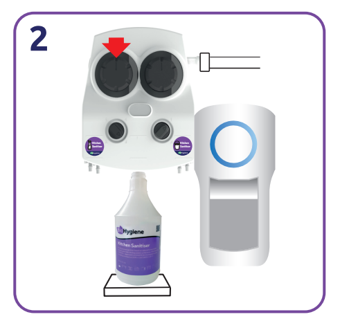
Use the Eco-Multi to dispense the correct dilution of Kitchen Sanitiser and water into a 750ml trigger bottle.