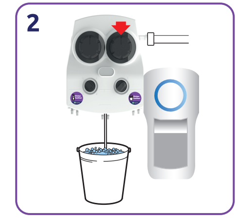
Use the Eco-Multi to dispense the correct dilution of Kitchen Sanitiser and water into a 5L mop bucket.