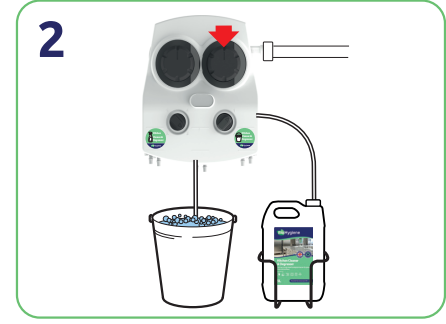
Use the Eco-Multi to dispense the correct dilution of Kitchen Cleaner & Degreaser and water into a 5L mop bucket.