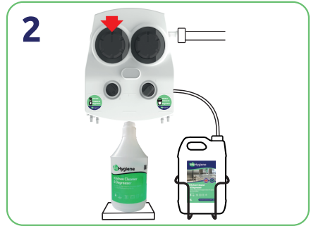
Use the Eco-Multi to dispense the correct dilution of Kitchen Cleaner & Degreaser and water into a 750ml trigger bottle.