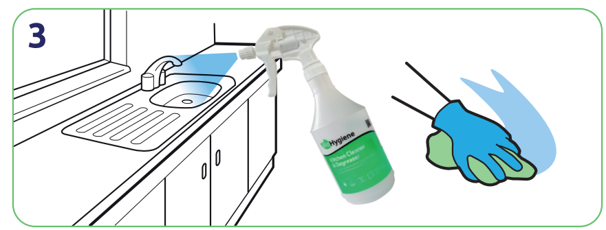
Spray surface and wipe with a cloth. No need to rinse