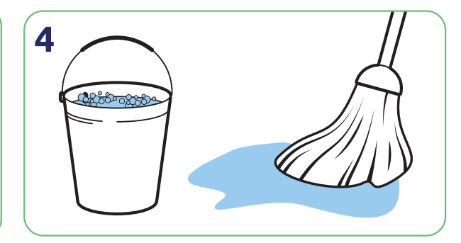
Mop surface. No need to rinse