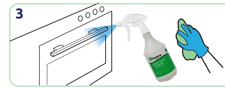
Spray surface. Allow contact time then wipe with a scourer or cloth. No need to rinse

Allow contact time for a Mop surface. No need to rinse deeper clean