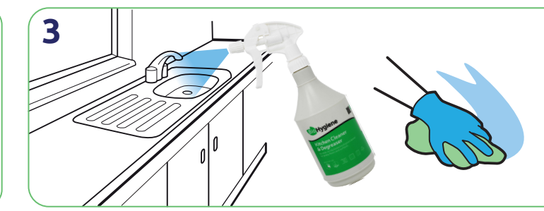
Spray surface and wipe with a cloth. No need to rinse