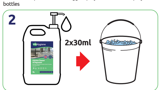
Dilute 60ml of product into a bucket