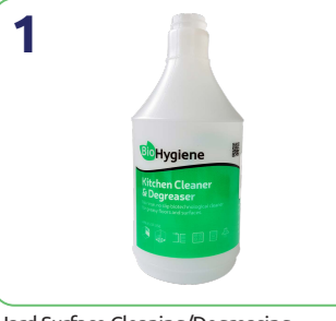
Hard Surface Cleaning/Degreasing