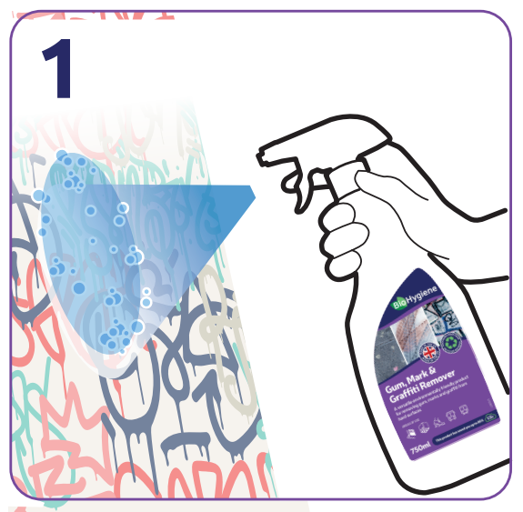
Spray on to affected area