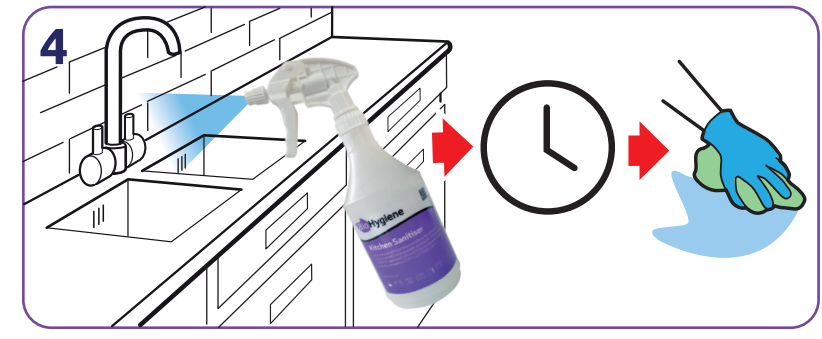
Spray surface, leave for the required contact time, (15 seconds for enveloped viruses, 30 seconds for bacteria) and wipe.**