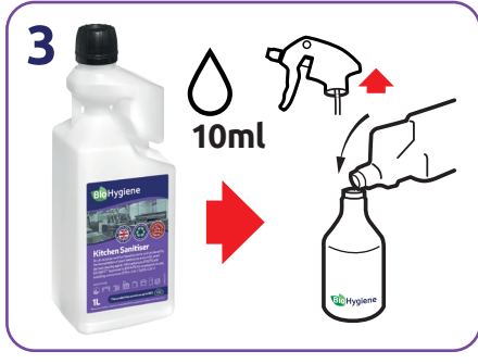
Dilute 10ml of product into a 750ml trigger spray. 1x1L will make up 100 triggers.