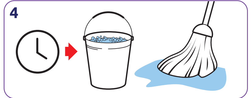
Mop surface, leave for the required contact time, (15 seconds for enveloped viruses, 30 seconds for bacteria). No rinsing necessary. Leave to air dry.**