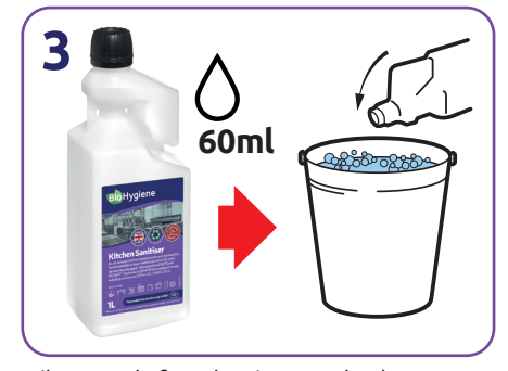
Dilute 60ml of product into a 5L bucket.